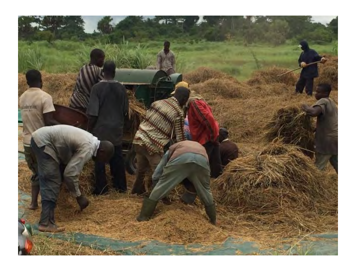
Figure 3: A group of rice farmers working collectively to thresh a harvest.