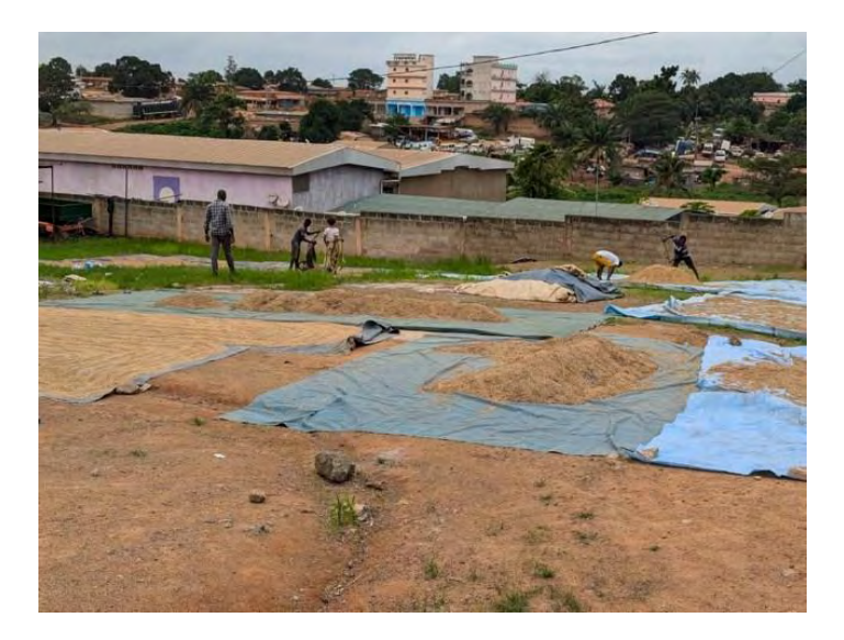
Figure 5: Drying of paddy rice in the courtyard of a mill in Gagnoa.

After the threshing activities, the harvest goes through several steps before it is marketed. The paddy rice must be dried to reduce its moisture content, then winnowed to remove impurities and other external elements. It then undergoes a transformation process that removes its outer shell to produce the polished rice sold on the markets. In the areas surveyed, except for drying, which is often done on the edges of the rice fields, these activities are carried out at mills (Fig. 5) where farmers bring their harvests through transporters.