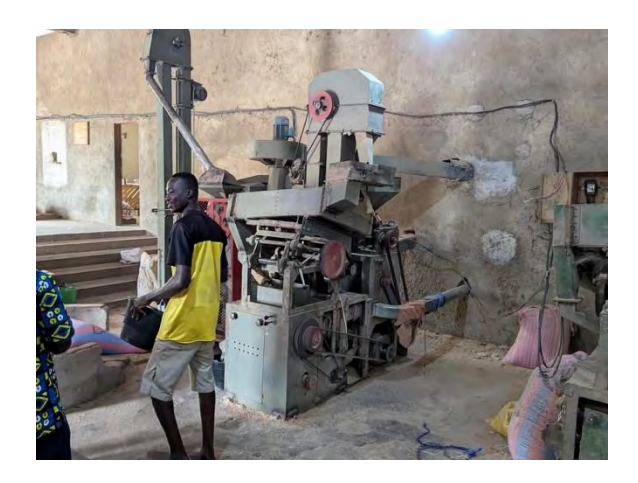
Figure 6: A husker in a mill in the city of Gagnoa