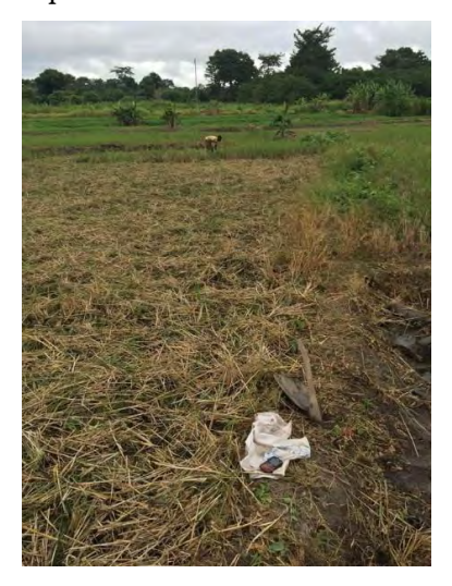
Figure 4: A mobile phone placed next to a daba, the main tool used by rice farmers.

It is during the harvest period that I get help from other people. I have their number, so when the time comes, I call them. As I said, I call the people I work with and I receive information from the cooperative<sup>23</sup>.